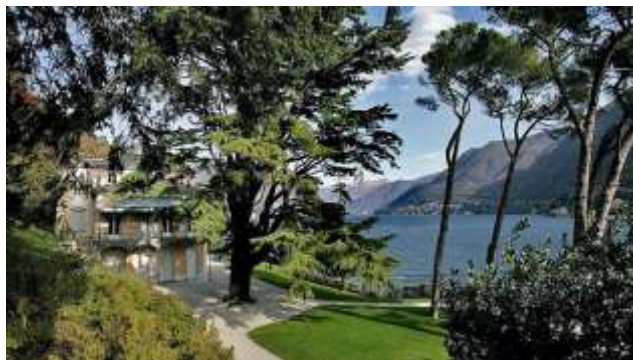
Figure 3 Villa Grumello, Lake Como, Italy

The entire event was held online and remotely due to the coronavirus outbreak, instead of at the lovely Villa Grumello, Lake Como Italy.